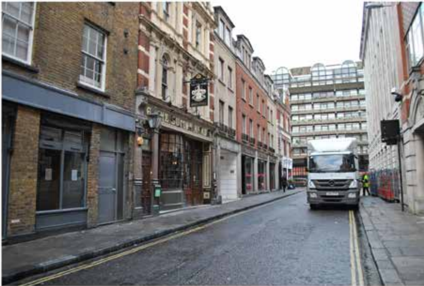
View along Carthusian Street looking east