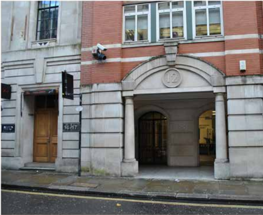
Entrance to 14-17 Carthusian Street