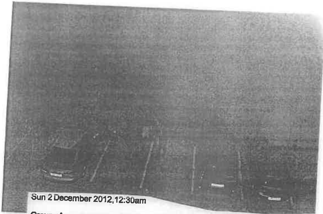
Sun 2 December 2012, 12:30am

Group of young people, talking very loudly in front of Florin Court, south side, by Charterhouse Square gates